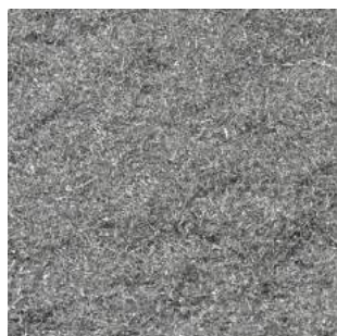
Stainless Steel Fibers